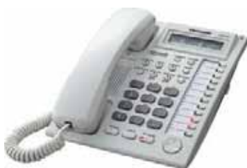
■ KX-T7730 LCD, Speakerphone Unit