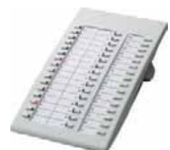
■ KX-T7740 DSS Console