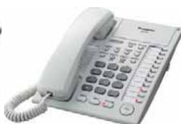
■ KX-T7720 Speakerphone Unit