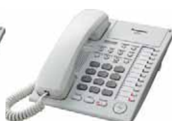
■ KX-T7750 Monitor Unit